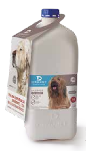
Neutral Base Aroma

Professional beauty line for skin and coat care